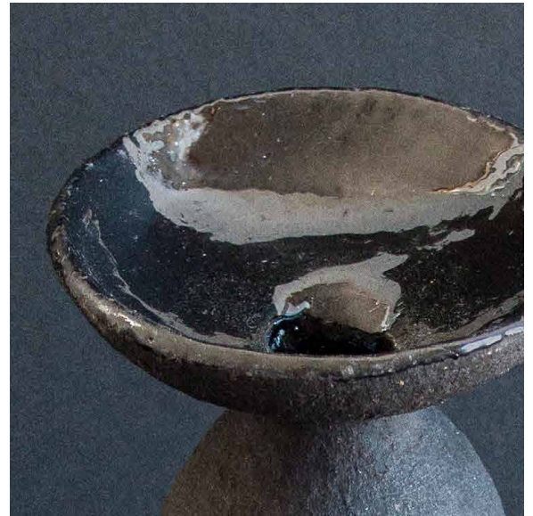
ABOVE ( NEW RESIN APPLIED )

THE 'OLEIROS' (POTTERS) WHO SPECIALIZED IN THIS TECHNIQUE WERE EVERYWHERE. TO CREATE THE XACRA COLLECTION WE PARTNERED WITH THE LAST ARTISAN ALIVE WHO STILL MASTERS THIS TECHNIQUE, PRESERVING THE CRAFT AND PREVENTING THIS ART FROM EXTINCTION. THE ARTISAN RESPECTS THE ORIGINAL TECHNIQUE, WITH A LOW WHEEL, ALMOST AT GROUND LEVEL, WHICH HAS TO BE KEPT ROTATING BY HAND WHILE COILING THE PIECES TO GIVE THEM THE DESIRED SHAPE. HE USES THE SAME INDIGENOUS CLAYS AS HIS ANCESTORS TO MAINTAIN THE CHARACTERISTIC TEXTURE. TO FIRE THE PIECES, HE USES A WOOD OVEN THEN SMOKES THE PIECES TO BLACKEN THEM, USING DRIED BRANCHES OF THE NATIVE CARQUEIXA PLANT. LASTLY, TO WATERPROOF THE PIECES, HOT MELTED NATURAL PINE RESIN IS POURED ON THE INSIDE OF THE PIECES.