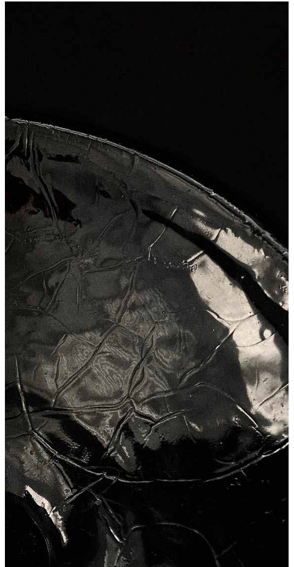
BELOW ( AGED RESIN )