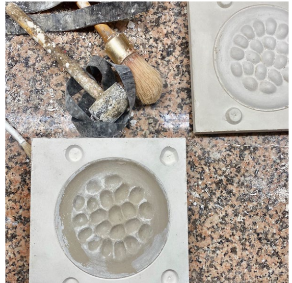
ABOVE ( THE MAKING OF A HAND-CAST PIECE )

EVERY DISH IS A CAREFULLY HANDCRAFTED STONEWARE PIECE THAT HAS BEEN FIRED AT HIGH TEMPERATURES TO ACHIEVE A ROBUST STRENGTH WHILE KEEPING AN ETHEREAL AND DELICATE LOOK. WHEN LOOKING CLOSER IT IS POSSIBLE TO APPRECIATE A SUBTLE GALVANIZED-LIKE FINISH. THE MATTE AND SHINY VITREOUS TEXTURES ADD EXTRA STRENGTH WHILE GIVING THE PIECES A SPECIAL CHARACTER. FULLY DRESSED TO PERFORM ITS BEST SHOW.